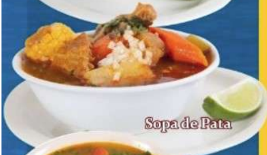
Sopa de Pata