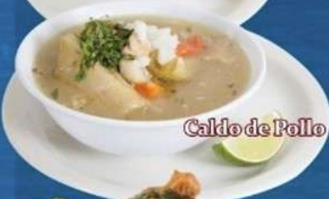
Caldo de Pollo