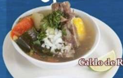
Caldo de Res